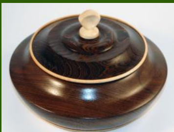
Contest Entry by Terry Elfers