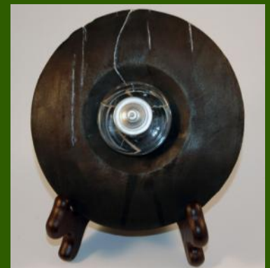
Contest Entry by Bill Warden III