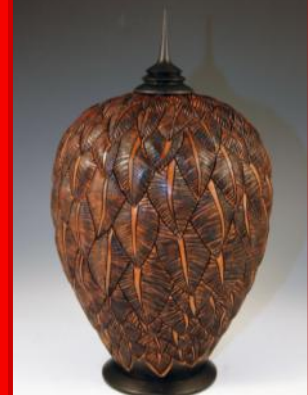
2nd Place Master Class by Ralph Tedeschi