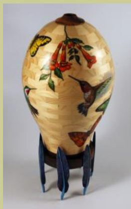
Painted Segmented Hollow Form by Ralph Tedeschi