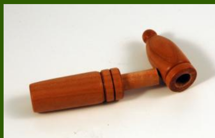
Cherry Needle Holder by Gary Claytor