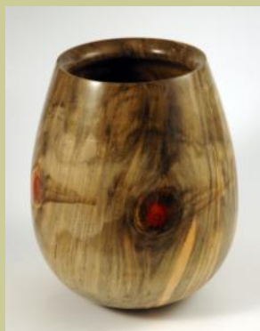
Norfolk Island Pine by Linda Suter