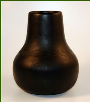
Contest Entry by Len Cribbs