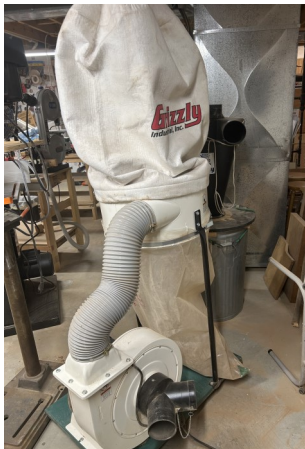
Grizzly Dust Collector; 2 Hp. 2 Ports - $300.00