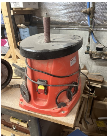
Oscillating Spindle Sander (Unsure of Brand) - $75.00