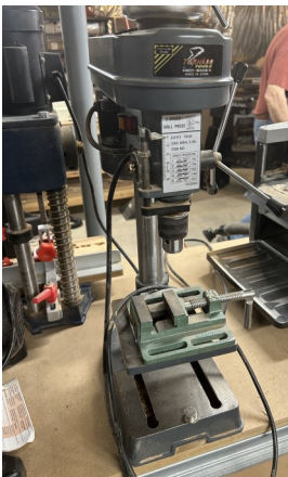
Tornado Table Top Drill Press; 5 Speed with Vise - $75.00