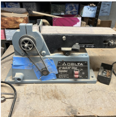
Delta 4"Belt/6" Disc Sander - Table Top; 1/3 Hp. - $35.00