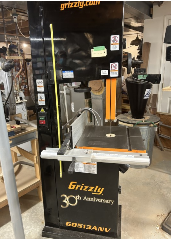
Grizzly Bandsaw; 30th Anniversary Edition; 17", 2Hp. - $900.00