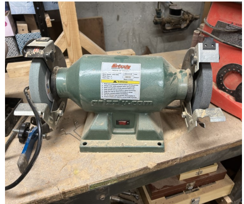
Grizzly 6" Grinder; 1/2" Hp.; 3450 RPM - $40.00