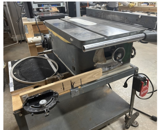
Delta Rockwell 10" Table Saw; 1 HP.; With Extra Blades and Dado Blade Set; Crosscut Sled; $250.00