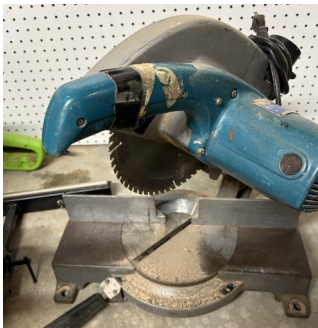
Makita Miter Saw - 255mm Model 2401B - $150.00