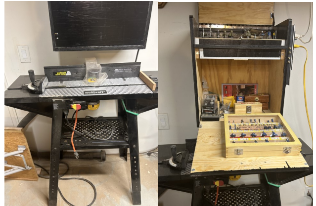
Wolfcraft Router Table with legs; With Dewalt Router; With Storage Case and Numerous Router Bits - $500.00