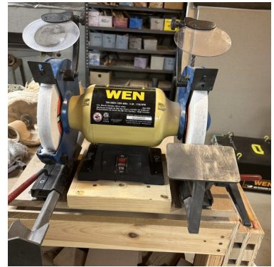
Wen Grinder; 1750 RPM; 8" Wheels; With Wolverine Grinding Jig and Vari-grind Jig. - $150.00