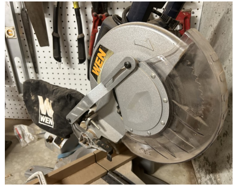
WEN 10" Sliding Compound Miter Saw—Model 70716—$90.00