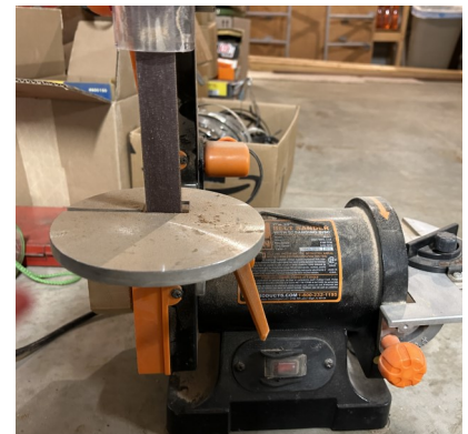
WEN Belt Sander—1x30" - Model 6515T -$45.00