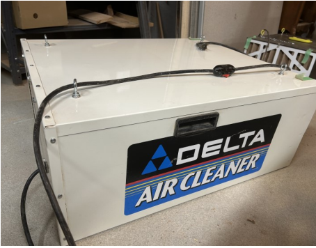
Delta Air Cleaner; 1050 RPM - $200.00