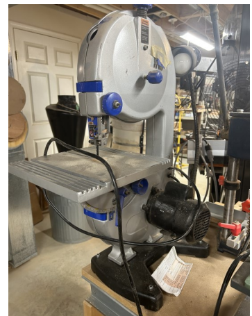
Wilton Tabletop Bandsaw; 9" $50.00