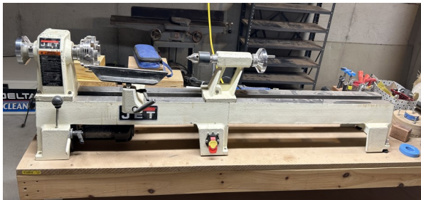
Jet Mini Lathe with 26" Bed Extension - Doesn't Run - $475.00