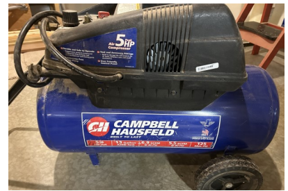
Campbell Hausfeld Air Compressor - 13 gallon - 5 HP - 125 psi max — $200.00