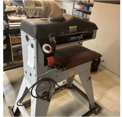
Delta Drum Sander; 1.5 Hp., Model 31-255X, 18"/36" - $900.00