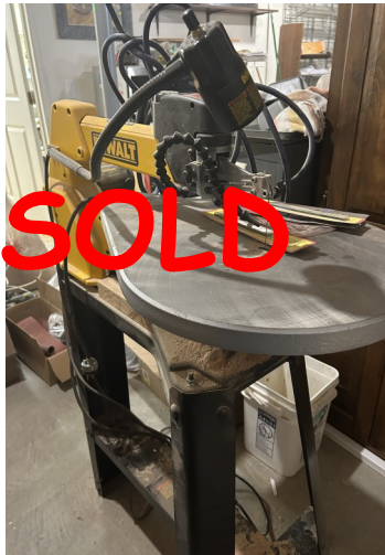
Dewalt Scroll Saw; 20" Throat: with Stand & Light; Model DW 788 - $500.00