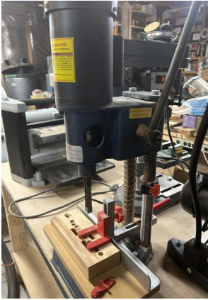
Mortising Tool (Unsure of Brand); 1/2 Hp. $75.00