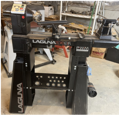
Laguna Midi Lathe 1216; with 10" Bed Extension; 1Hp. - $700.00