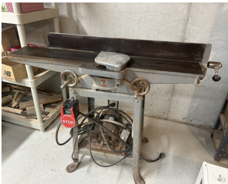
Delta Jointer; Bed is 6" X 48"; Bed is showing signs of rust. - $125,00