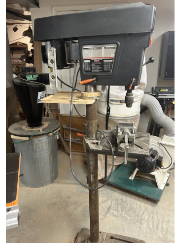
Sears Craftsman 15" Drill Press; Floor Model 1/2 Hp. - $150.00