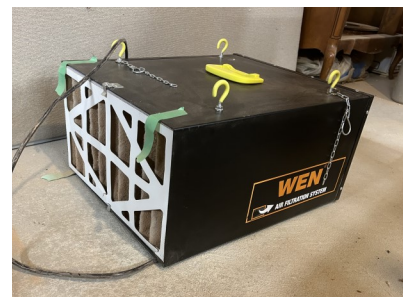
Wen Air Cleaner; Model 3410; 3 speed with timer and remote - $100.00